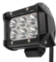
WORK LIGHT SPOT 4"/100MM $35.00 VX41800S