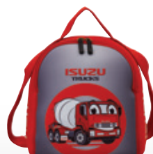
KID'S NEOPRENE BACKPACK