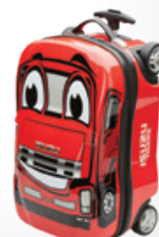
KID'S ROLLER LUGGAGE CASE