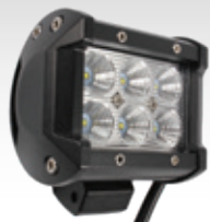
WORK LIGHT FLOOD 4"/100MM $35.00 VX41800F