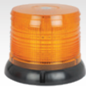
LED BEACON/ STROBE 80 W/BOLTS $130.00 VX705A