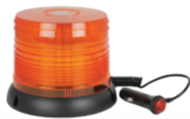
LED BEACON/ STROBE 80 $135.00 VX705ACC