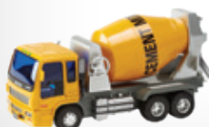
CEMENT MIXER TOY TRUCK