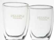
GLASS COFFEE & TEA SET