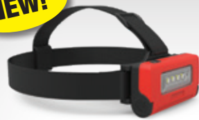
LED HEAD LAMP $50.00 VXHHLED22